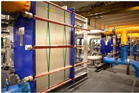
Plate type Heat Exchanger

Not the operation of the Steam trap is a Plate type Heat Exchanger 0.2 MPaG operating at the following low-pressure steam in tone, drainage and retention in the plate, takes a large thermal stress in a part, the plate packing has faced with cracked troubles in many sites.