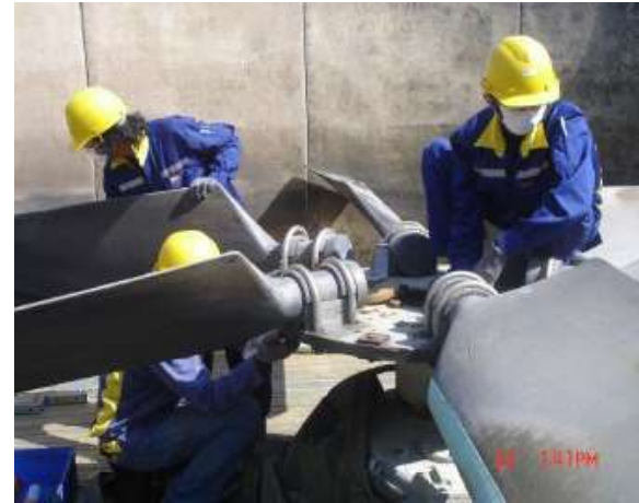
Existing Fans Removed (6 blades)

ENCON Energy Efficiency Axial Flow FRP Fan