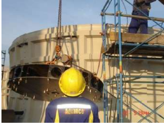
New ENCON Hub Lifting