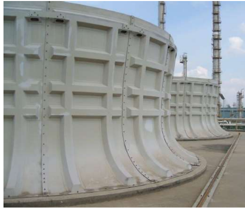
PTTCH Cooling Tower Fan dia. 24 feet

ENCON Energy Efficiency Axial Flow FRP Fan