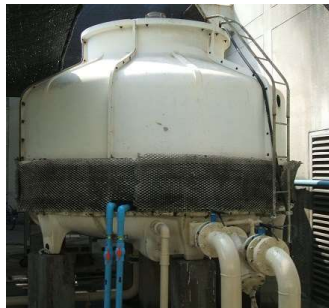
Cooling Tower : Fans Dia. 1470 mm.