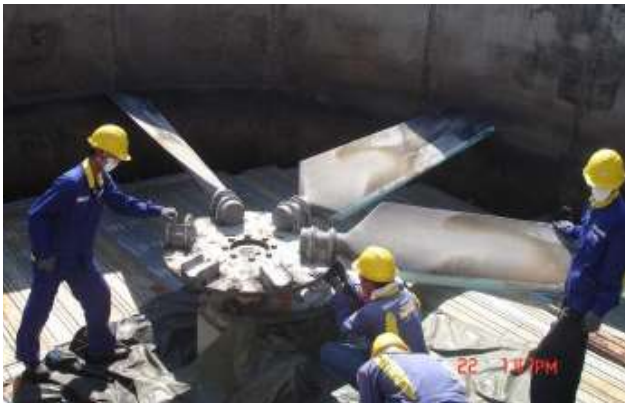
Existing Fans Removed (6 blades)