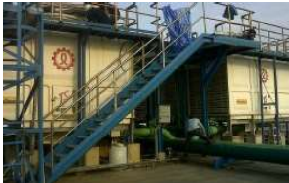
P & G Cooling Tower Fan dia. 2000 mm.