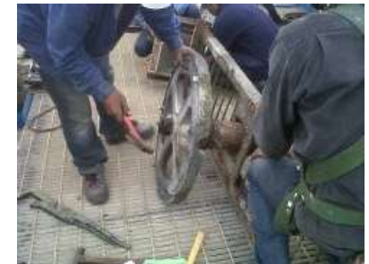
Existing Aluminium Fans & Hub Removed (4 blades)