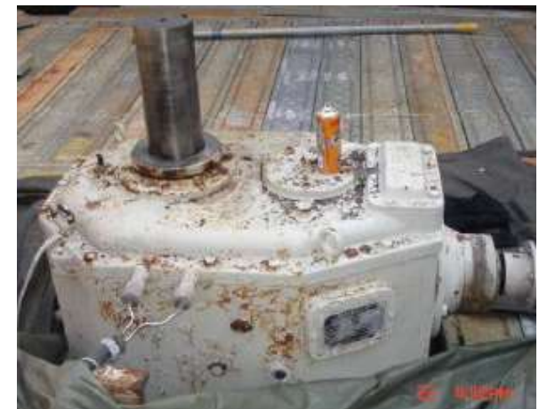
Existing Gear Box with Shaft