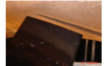
New ENCON Blades Installation & Angle adjustment

ENCON Energy Efficiency Axial Flow FRP Fan