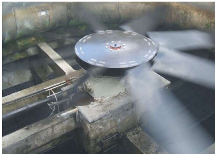
ENCON Fan Operation

ENCON Energy Efficiency Axial Flow FRP Fan